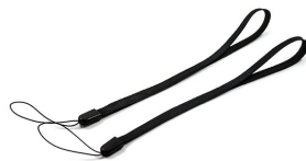
FOXX Power-Glow Lanyards