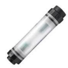
FOXX Power-Glow Mini