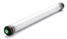
FOXX Power-Glow Plus