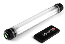
FOXX Power-Glow IR