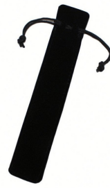
FOXX Power-Glow Mini Carry Bag