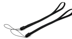
FOXX Power-Glow Lanyards