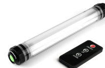
FOXX Power-Glow IR