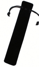
FOXX Power-Glow Plus Carry Bag